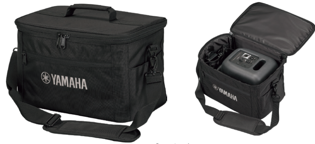
Carrying bag BAG-STR100