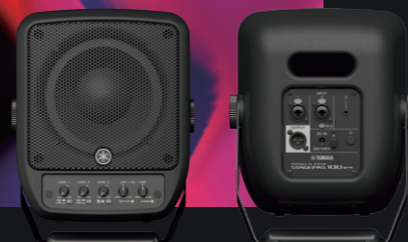
STAGEPAS 100BTR shown

Portable PA System STAGEPAS 100BTR STAGEPAS 100